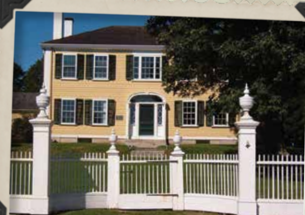
King Caesar House, 1809