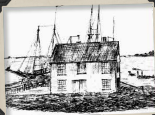
Winsor's Wharf (Snug Harbor), 1848

Explore more! The Reynolds-Maxwell Garden, King Caesar House and Bradford House are among the more than 30 properties owned and maintained by the Duxbury Rural & Historical Society.