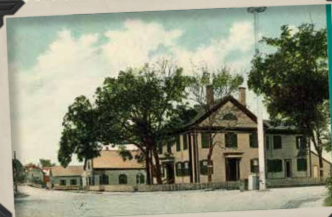
Duxbury Village Postcard, c. 1910

Explore more! Parking on the right, before the bridge. Carefully cross over the road to visit the Reynolds-Maxwell Garden next to the bridge.